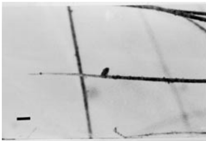
FIG. 1—A microclot of blood attached to the shaft of a hair sampled from the suspect dog. Scale bar = 50 microns.